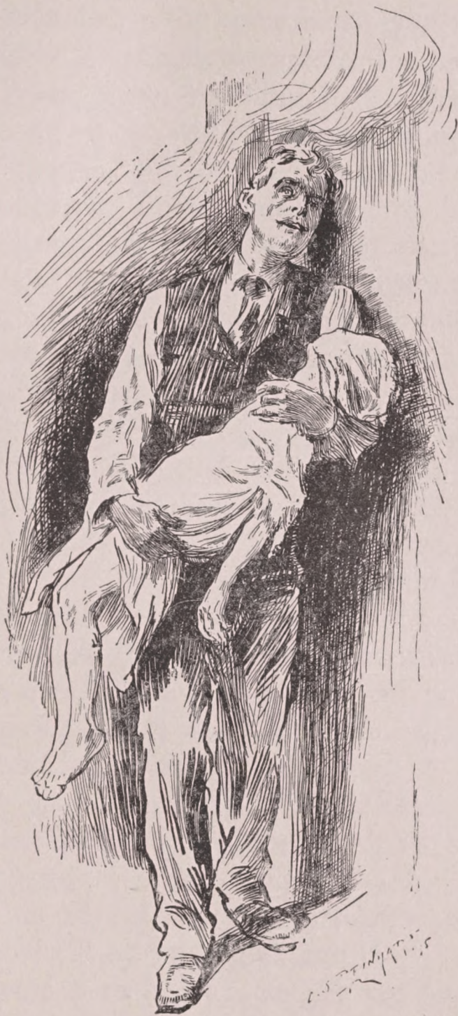
He carried the almost lifeless boy